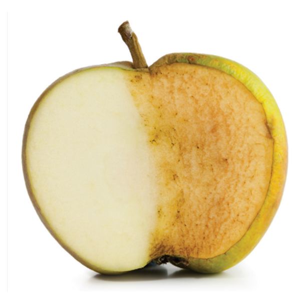
Moisture loss during postharvest.

Edible coatings to act as carriers of antimicrobial compounds, help to extend the shelf-life of the fruits and reduce the risk of pathogen's establishment on their surfaces, aloe vera is a biopolymer has the capacity of acting as elicitor activating enzymes production related to mechanism of fruit's defense reducing fruit spoilage, edible coatings can be applied with different methods that range from immersion and aspersion to more sophisticated methods such as spreading/brushing, additives are incorporated as active agents, Impact of postharvest losses of fruits, production and processing of plant-based foods, of great importance is the postharvest, where it is estimated that the losses of fruit and vegetable products exceed 20% worldwide, mainly caused by microbiological and physiological agents, protective barrier during processing, handling, and storage of food products, delaying the deterioration of food, improving its quality and extending its shelf-life, edible coatings on fruits for shelf-life extension and management of the quality, most of the fruits we consume are treated with coatings to extend their shelf-life, Fruit continues to lose water and solutes after harvest due to biological activities.